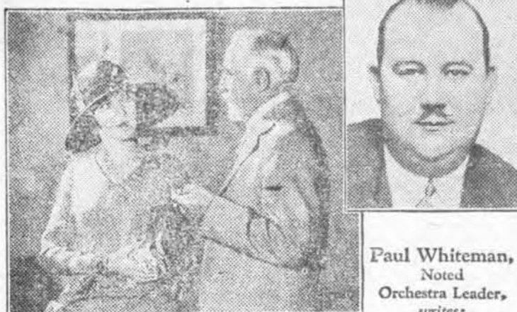
Paul Whiteman, Noted Orchestra Leader, writes:

Now Read What 11,105* Doctors say About Lucky Strike Cigarettes Because "It's toasted"