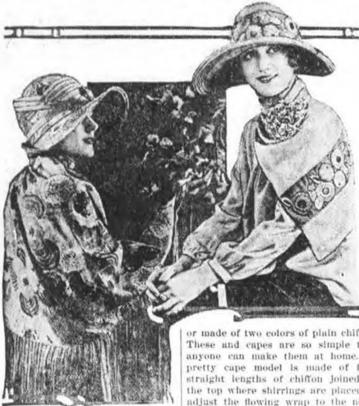
WRAPS FOR AFTERNOON WEAR.

style, whatever may be the transient whims of fashion, and it has inspired many of them. Scarfs are the most popular of these children of the shawl. Two of them are shown here, and one of them at the left, reflects the original embroidered shawl as in a looking glass. It is made of printed silk crepe and finished along the lower edge with silk fringe in several colors. Similar scarfs of chiffon show huge blossoms scattered over a plain surface, and silk fringe repeating the colors in the flowers. Nothing is prettier than the squares of printed chiffon or georgette, finished with wide borders of plain chiffon in a harmonizing color,