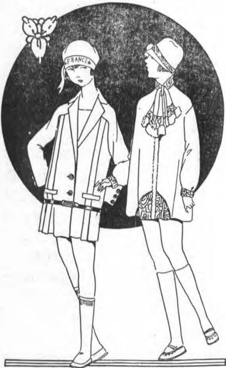
TWO OF THE NEW MODELS FROM PARIS.

colored flannel, touches of pale tan or white flannel appear in collar and cuffs. Borders made of cross-stitch embroidery, in two or three colors of yarn, are liked on white flannels. For summer afternoons and evenings, fashion is taking more and more to shawls, scarfs, capes and dolmans, or to long, loose coats of light fabrics, that are wrapped about the figure. They are all descendants of the beautiful Spanish shawl, whose vogue has persisted through many seasons and is likely to continue through many more. Anything so superb as a beautiful, embroidered shawl is good