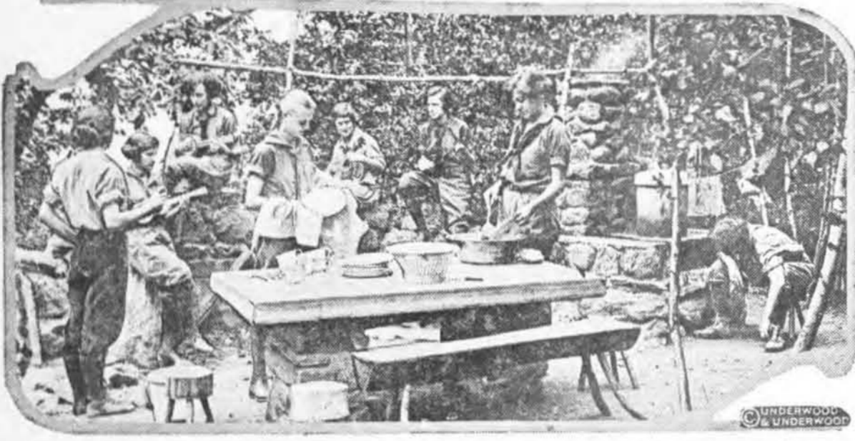
Washing dishes is a pleasure for the girl scouts at Camp Andree Clarke. Briarcliff Manor, N. Y., for their fellow scouts serenade them during the "ceremony."