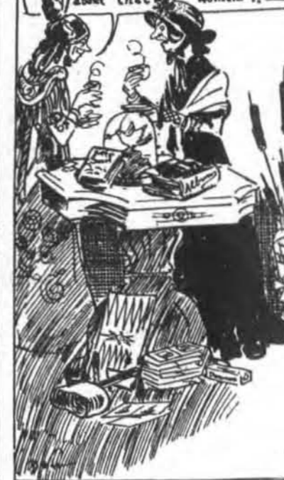
The horse-hair chair

So I say to her, say I, now see here, Jen, I don't want to hear one single thing that I don't want to hear.