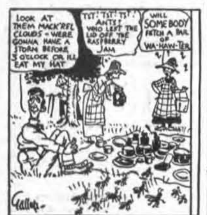
The Man Who is First to Get to the Table but Never Can See Anything to Do Except Preach Rain and Fight Flies.

THE picnic is a place where people go to relax from labor and study the bug family.