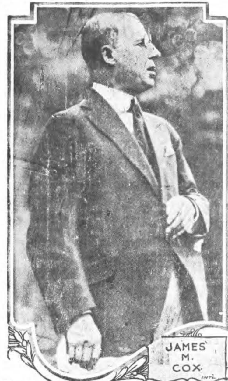
JAMES M. COX.

DAYTON, July 6—James Middleton Cox was three times governor of Ohio—an honor enjoyed by only one other Ohioan, Rutherford B. Hayes.